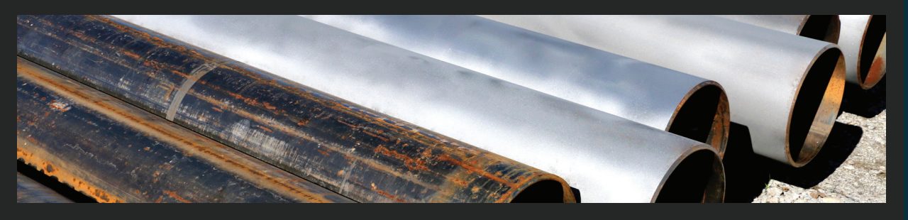
We provide dry ice blasting services from areas such as Edmonton, Fort McMurray, Calgary and any location within Alberta and British Columbia.

Our before and after pictures speak volumes about Dry Ice Blasting. Our cleaning solutions are effective, environmentally friendly and the best cleaning method for sensitive work environments not suitable for traditional cleaning methods.