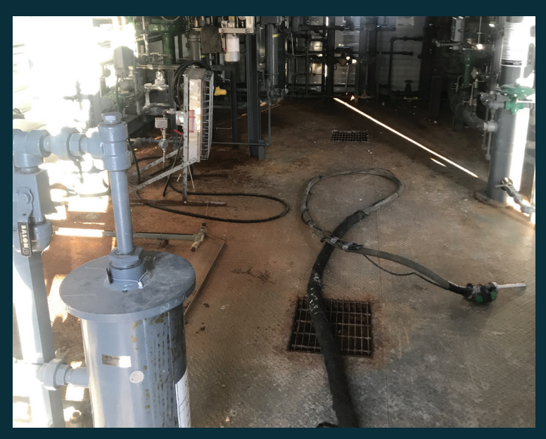
This oilfield shack was dry ice blasted & painted by Carmad and is just one of many completed with little to no downtime.

Our ability to offer quality services is due to our state of the art equipment, highly trained personnel and outstanding customer service.